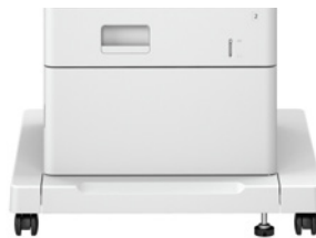
Cassette Feeding Unit-AR1