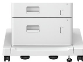
High Capacity Cassette Feeding Unit-D1